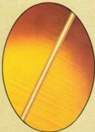
Brown Sunburst Finish